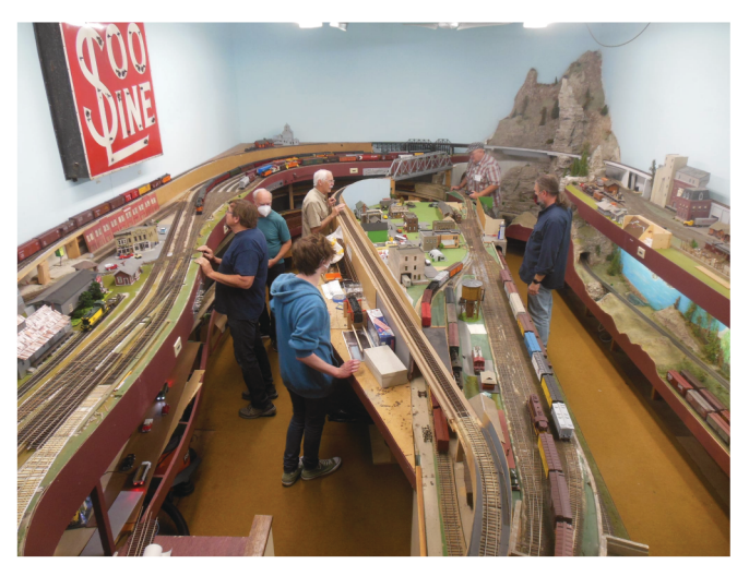
Attendees of the WLD 2021 Fall Meet view the four main towns in the baggage room (left to right) Hilbert Junction, Chilton, Sherwood, and St. John..

no insulation. There was a hardwood strip ceiling which was carefully removed and reused to cover the rough plank floor. Then drywall was applied to the walls and ceiling. The Neenah-Menasha Model Railroad Club had its start.