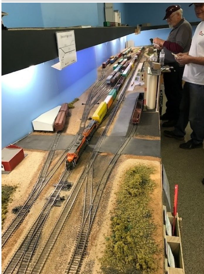
The photo is from the Divisions 2017 Operating session at Joel Weeks Great Northern in 1969 layout. Pictured is a westbound freight preparing to leave the Great Northern's busy Wilmar, MN yard.