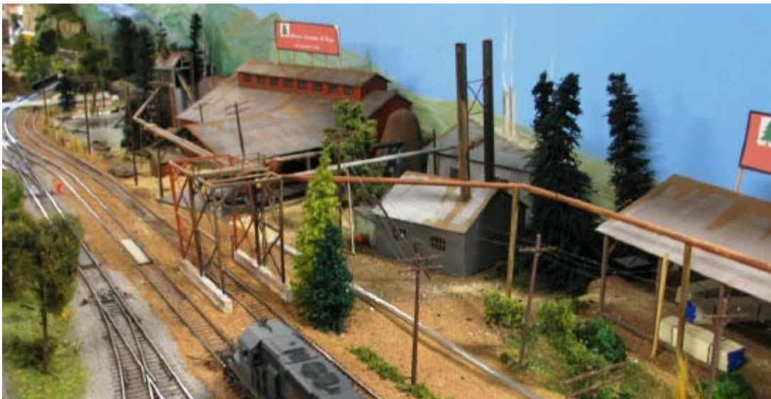
Quick shot of layout scene. Stay tuned for a future article with more professional photography!

There is one possible drawback: the club will no longer have easy, next-door-direct access to Engine-House Services and the tempting products within! But the membership is newly energized by the move and the potential new doors it opens. We look forward to sharing this new era with everyone; stay tuned for open house announcements.