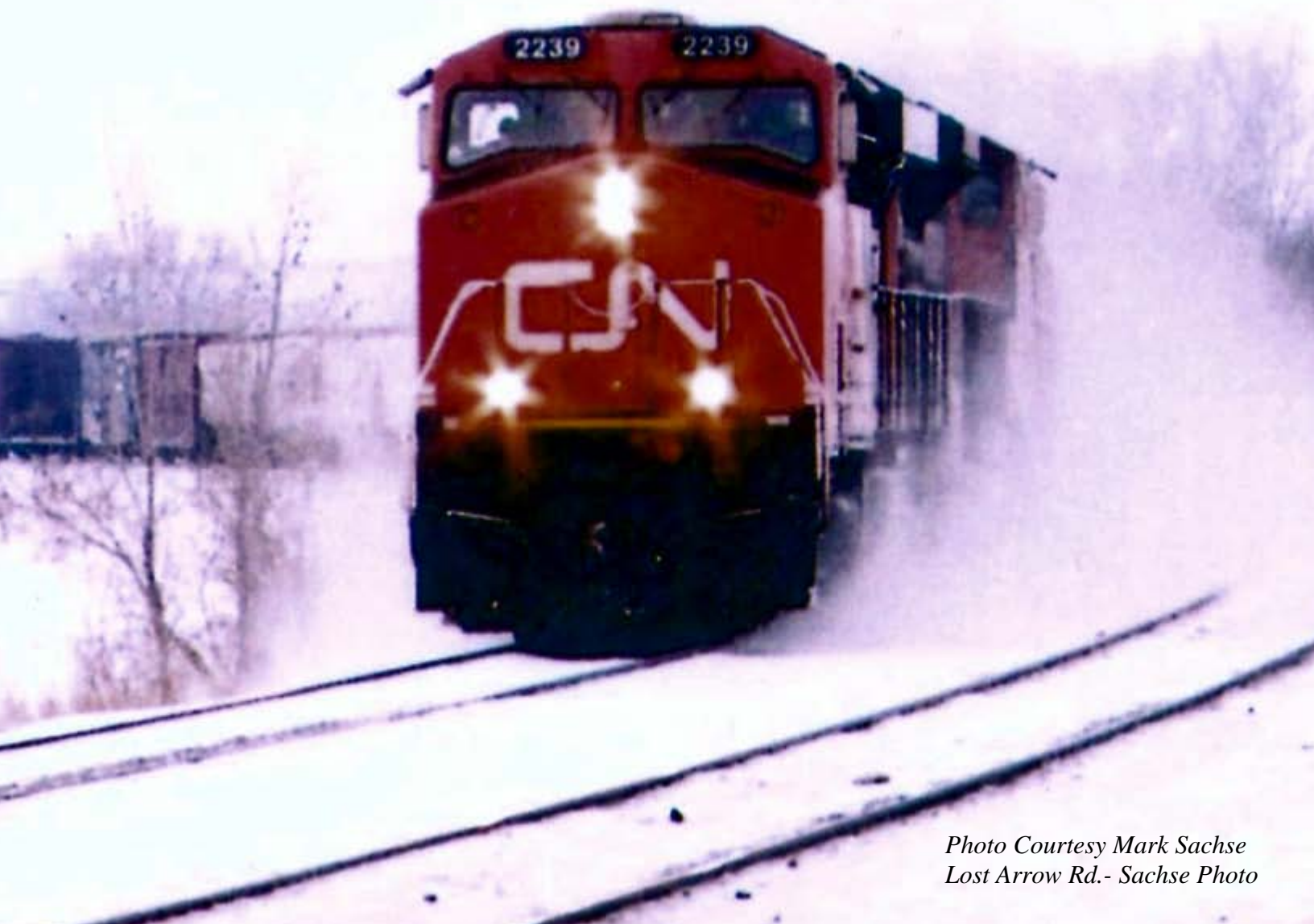
Lost Arrow Rd.

Merry Christmas and Happy New Year from the staff of The WinnebagoLand Whistle!