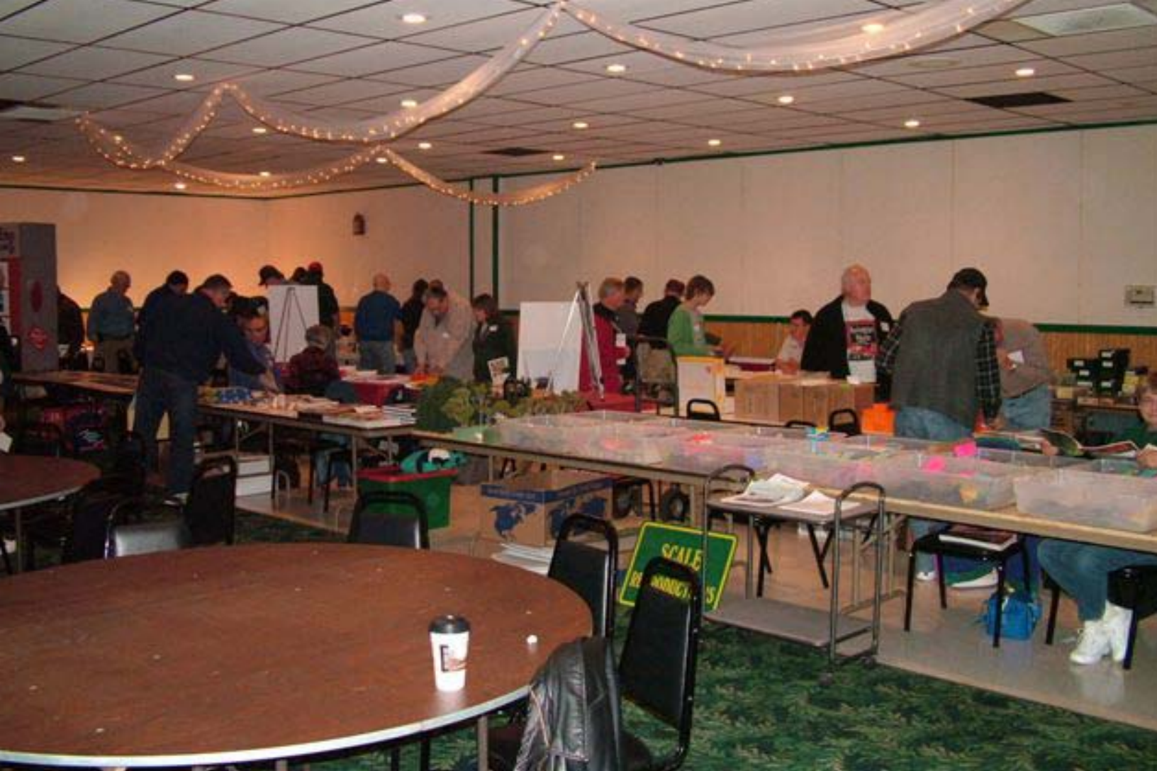
Attendees mill about the hall looking for information from the historical societies and a few deals!