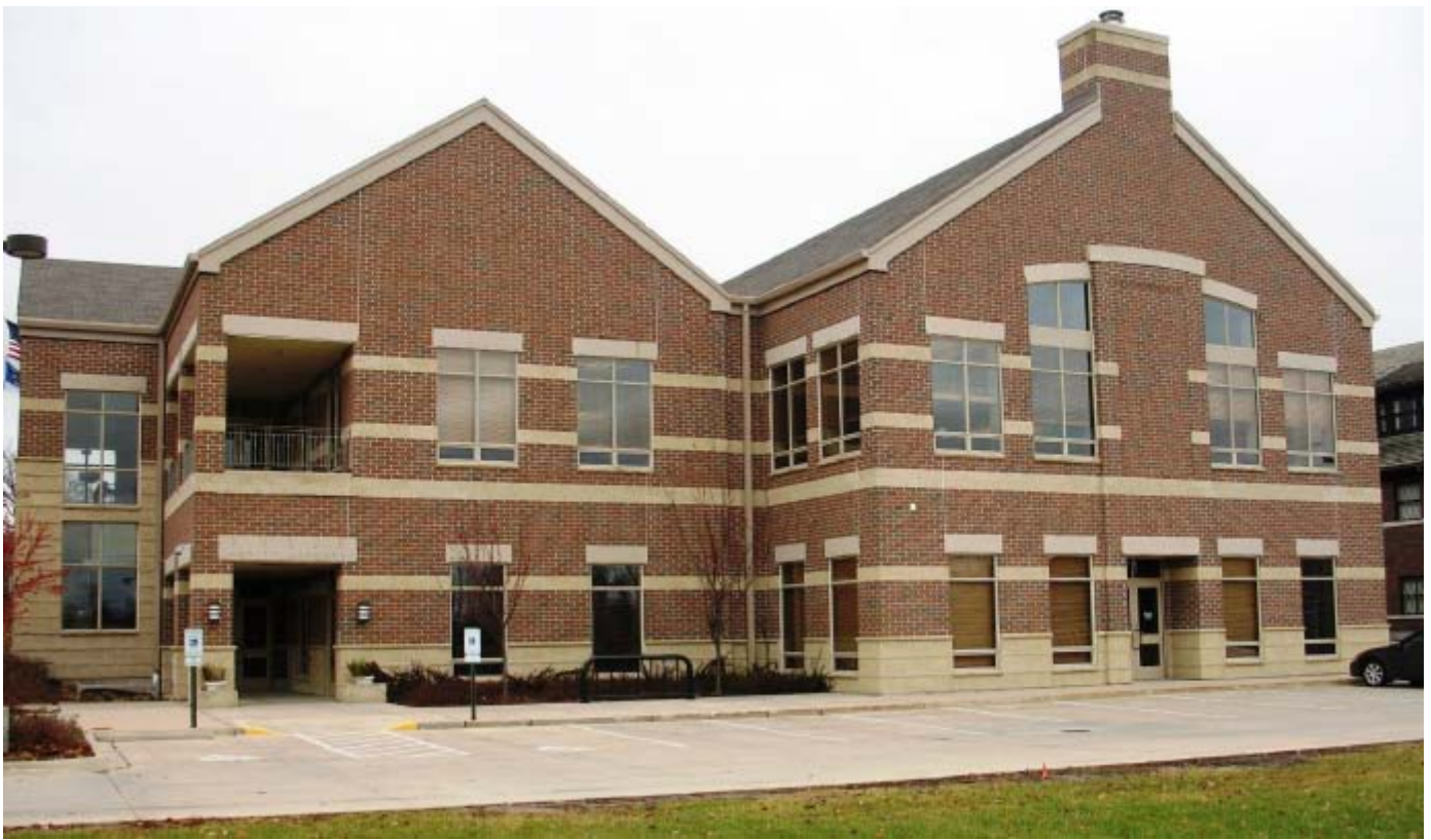
West elevation facing the Fox River; the Club's new entrance is on the right but the lower entry to the library on the left also connects to the Club on the interior.

This new location is a tremendous opportunity for the club. Not only is it in a high-profile, high-quality building, but its connection to the library offers many opportunities for public interaction. The GBAMRC's 501(c)3 tax-exempt status requires a dedication to providing educational outreach; the library board also saw this potential to have their children patrons interact with the club. As this relationship continues, it is expected that the club will be open during certain periods when the library is open, allowing direct public access. In addition, it will be easy (and potentially profitable) to hold special events in conjunction with the many festivals and other activities held in downtown DePere every year.