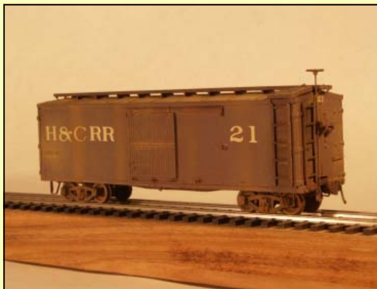
John Leow's freelanced boxcar- Merit Award level

I had fun judging nice models. Five were at the Merit level, and all were nice. Eye-candy! I often hear people complaining about the paper work. While we can easily justify the paper work (Contest Entry Form, Judges Score Sheet and supporting documentation) it can be a pain to prepare, particularly in a crowded contest room when you have other things you want to do! A solution is to fill out this stuff at home.