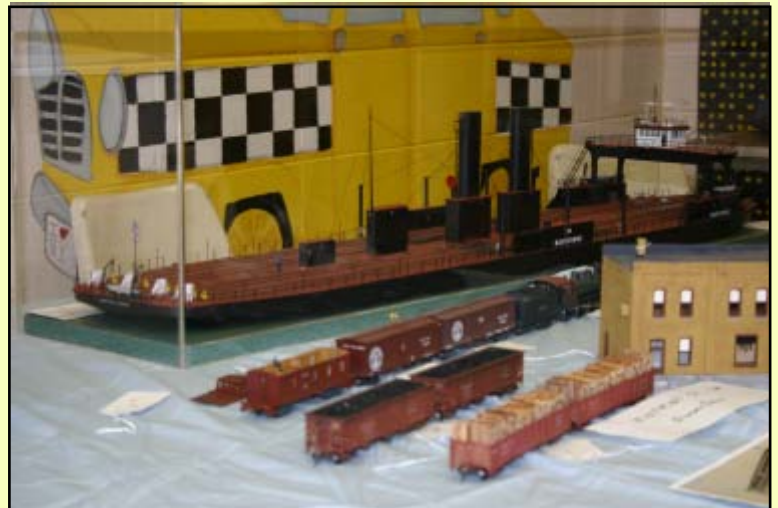
Various models on one of several tables in the contest room.

Editors Note: What a great display of models! While several were truly noteworthy, all were very nicely done and looked the part. We certainly also had some new faces like David Karkoski and Joe Erickson showing off some very well done models. David Allen continues his wrap up on the following pages.